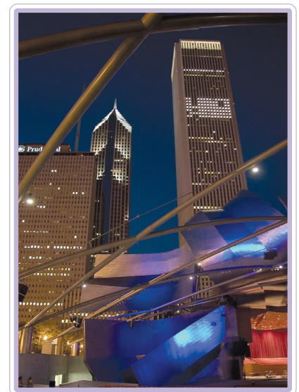
Jay Pritzker Pavilion in blue